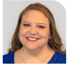
Dena Espenscheid Leadership Institute