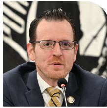
Senate Minority Whip Justin Ready